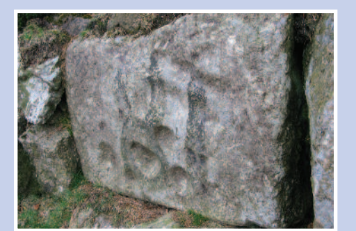
The Long Plantation cup stone.